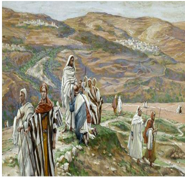
Christ Sending Out the Seventy Disciples Two by Two by James Tissot